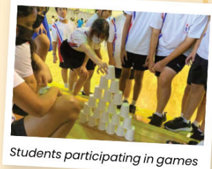
Students participating in games

It's not all work and no play at school, as Regenites have the opportunity to enjoy some sporting action at our annual Sports Fiesta, where a convivial and carnival-like atmosphere awaits!