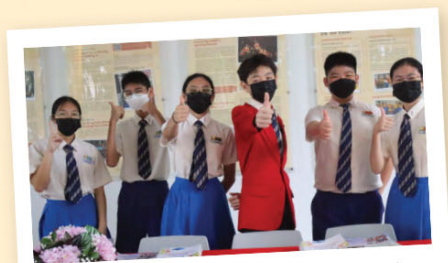
Student Leaders welcoming parents during Open House

Through this, we hope to see the next Greta Thunberg!