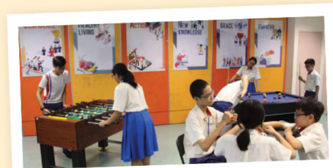
Students hanging out in the Changemakers Room

Designed for comfort and bonding, in the room, we have modular tables that facilitate group discussions, a variety of board and electronic games, carom boards, and brand new pool and foosball tables!