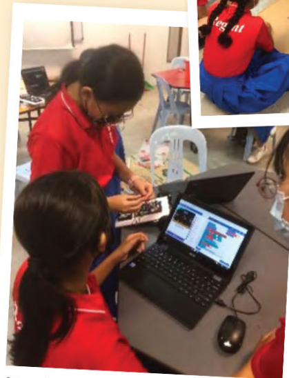
Secondary One students coding to control their RC car