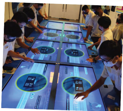
Students exploring their Aspirations

Dreams of yesteryear seemed simpler: to be a doctor, lawyer, teacher, accountant... But young people today face more complex transitions into adulthood. An increasing array of paths in education is open to them to realise their goals.